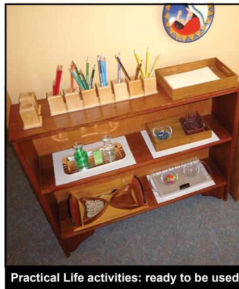
Practical Life activities: ready to be used

and committed to this way of helping children develop their spiritual and religious lives and look forward to learning a great deal from them.