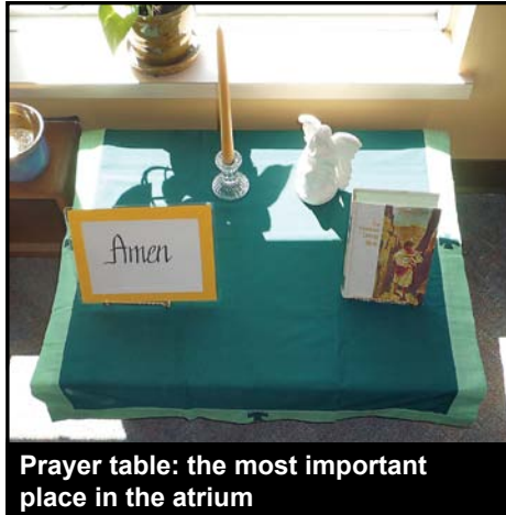
Prayer table: the most important place in the atrium

Atrium , in the back room behind the kitchen. Many parishioners have generously volunteered time and talent